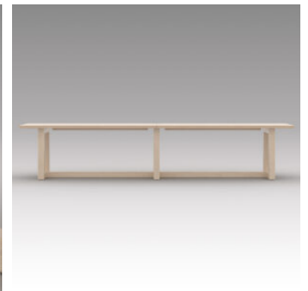
Portfolio, workplace table large, PF-WT-01.03