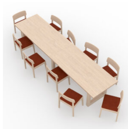
Portfolio, workplace table large, PF-WT-01.03