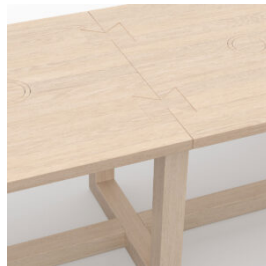
Portfolio, workplace table large, PF-WT-01.03