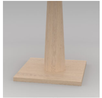
Portfolio, occasional table, PF.OT-01