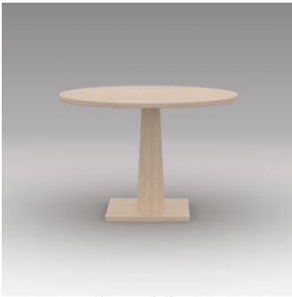
Portfolio, occasional table, PF.OT-01