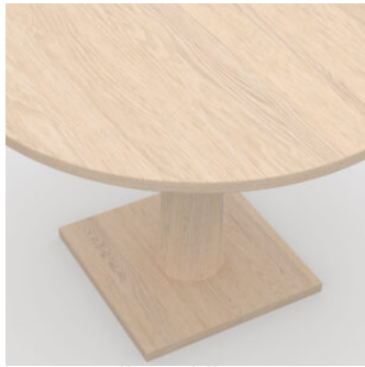
Portfolio, occasional table, PF.OT-01