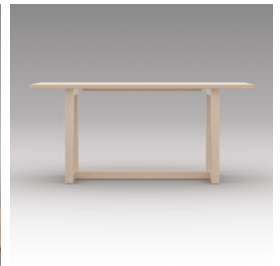
Portfolio, high workplace table, small, PF.WT-02.01