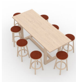
Portfolio, high workplace table, small, PF.WT-02.01