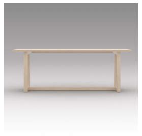
Portfolio, high workplace table, medium, PF.WT-02.02