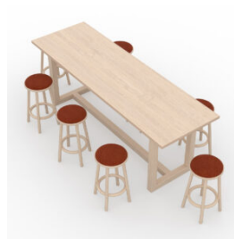
Portfolio, high workplace table, medium, PF.WT-02.02