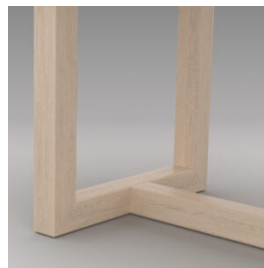
Portfolio, high workplace table, medium, PF.WT-02.02