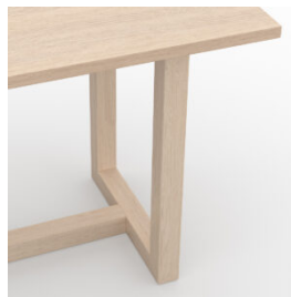
Portfolio, high workplace table, medium, PF.WT-02.02