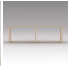
Portfolio, high workplace table, large, PF.WT-02.03