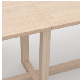
Portfolio, high workplace table, large, PF.WT-02.03