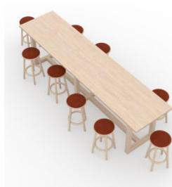
Portfolio, high workplace table, large, PF.WT-02.03