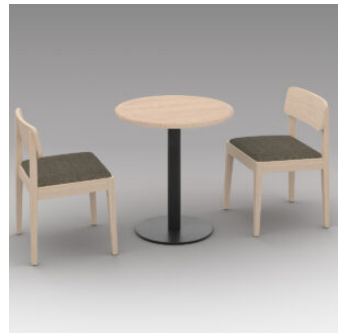
Portfolio, cafe round table, white, PF.TA-02.W