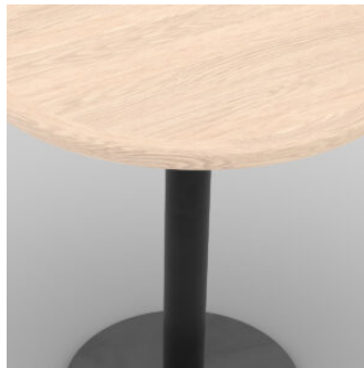
Portfolio, cafe round table, white, PF.TA-02.W