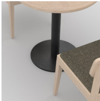
Portfolio, cafe round table, white, PF.TA-02.W