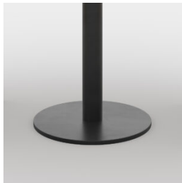
Portfolio, cafe square table, black, PF-TA-01.B