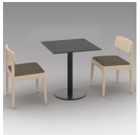
Portfolio, cafe square table, black, PF-TA-01.B