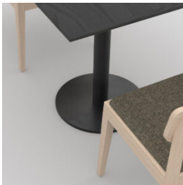
Portfolio, cafe square table, black, PF-TA-01.B