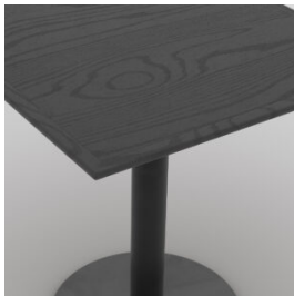
Portfolio, cafe square table, black, PF-TA-01.B