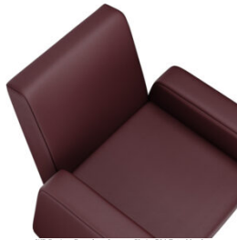
WP Design, Barcelona Lounge Chair, 704 Extrablond