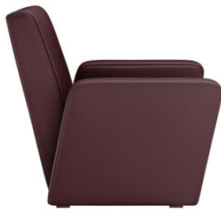
WP Design, Barcelona Lounge Chair, 704 Extrablond