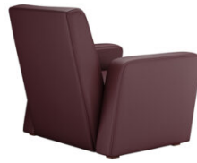
WP Design, Barcelona Lounge Chair, 704 Extrablond