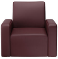
WP Design, Barcelona Lounge Chair, 704 Extrablond